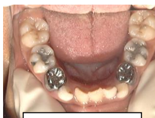
#26 is impacted

are told that space usually exists between the lower incisors so that when the large canines come in they push all that space closed. Now, if there is no space present, we ask the parents, “what do you think is going to occur when the canines come in?” The parents always state that the canines will crowd things up. Then, we ask, “if the lower incisors are already crowded, what do you think will occur when the canines erupt?” The parents always state we need to make more room for the canines.