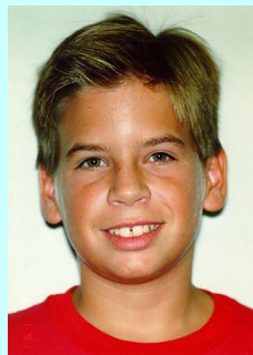
Begin Phase I

The below patient had a severely strong maxillary frenulum that caused a huge diastema between the upper central incisors. The incisors were moved together orthodontically very slowly to bring good bone with the teeth (along with expansion of both arches). The frenectomy was done removing it from within the bone. Then, a fixed lingual bonded retainer wire was placed. His mother was so pleased that she brought in a school photo to us (below) which makes you feel good!