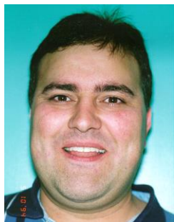
He was not only happy with his result but he shaved off his moustache!

Oh, by the way, the word frenulum comes from Latin "attachment". When patients come in for their first visit I always kid with them and ask them if they know what the frenulum is for? They usually state they do not know. I tell them that when the wind blows real hard it keeps their upper lip from flapping around like a piece of baloney.