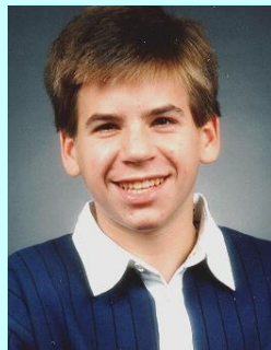
End Phase I