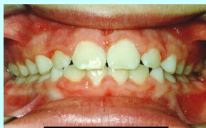
End Phase I

The answer to this is “yes”. The best time to treat them is between ages 6-11.